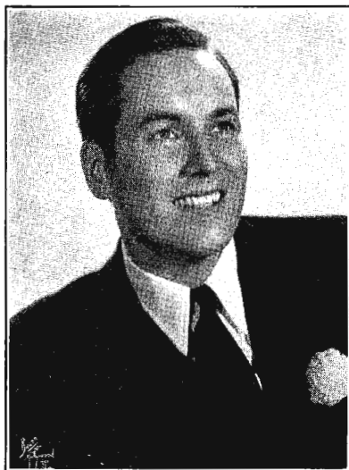
• LANNY ROSS •

BERGEN, EDGAR. Ventriloquist. (R) Chase & Sanborn Program, 1937-39 (Standard Brands, Inc., NBC Red). (GA) Several appearances on the Rudy Vallee Show. (F) Universal, Warner Bros., M-G-M; shorts. (V) Many years.